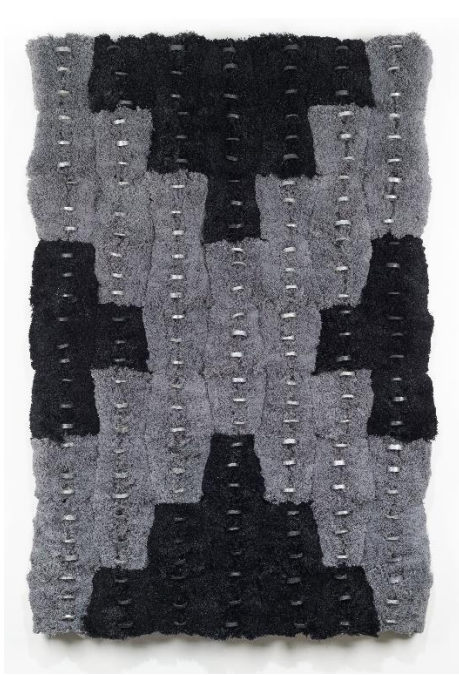
Brenda Mallory Cherokee Nation, b. 1955 O'OOJJ DHAAT , 2023 To Carry an Ember , 2023 Deconstructed thread spools, spool cores, paint on wood panel