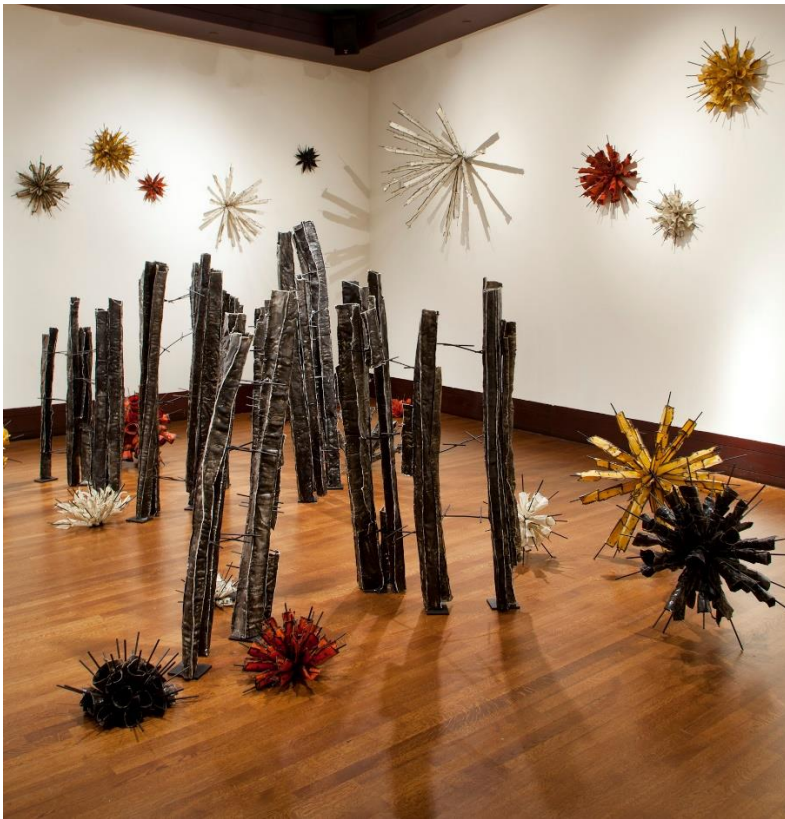
Brenda Mallory Cherokee Nation, b. 1955 JAWP h5P0Wh TG-P0VJ J0VAT 05P0W0Y , 2015 Recurring Chapters in the Book of Inevitable Outcomes , 2015 Welded steel, waxed cloth, nuts, bolts, hog rings

The expansive properties of cloth and steel also find expression in Recurring Chapters in the Book of Inevitable Outcomes (2015). Combining pattern and iteration, ashen pillars emerge from the floor as bursts of star-like shapes float above. What is inevitable here? On the one hand, and in keeping with Mallory's insistence on ecological themes, this could be read as an apocalyptic scene, the result of uncontrolled avarice, colonial extractivism and neglect. On the other, the colorful orbs insinuate a luminosity that is at odds with the destruction below. This contrast—the assemblage of densely worked materials into spare vignettes—asks us to question linear narratives. The installation also refuses a teleological approach, instead inviting reflection on the cyclical forms of nature and on the concept of inevitability.