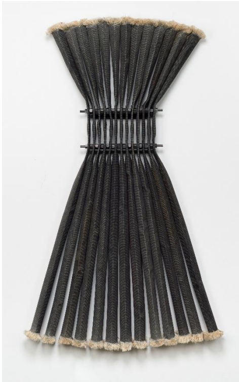
Brenda Mallory Cherokee Nation, b. 1955 ᎠᎩ ᎠᎩᎩᎩᎩ ᎠᎩᎩ ᎠᎩᎩᎩᎩ ᎠᎩᎩ ᎠᎩᎩᎩ #16 (Ꭰ ᎠᎩᎩᎩᎩᎩ), 2022 Firehose Experiment #16 (Now We Reap), 2022 Linen firehose, paint, threaded rods, washers, nuts