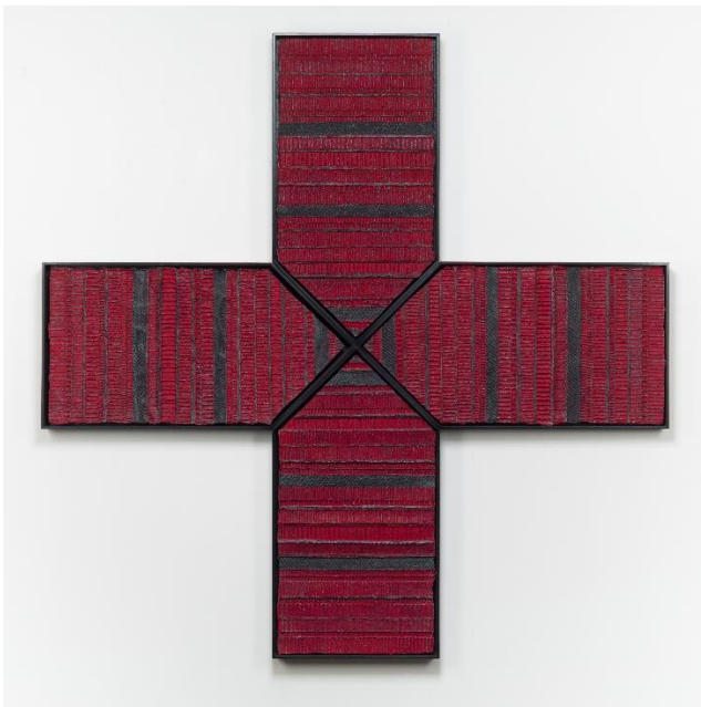
Brenda Mallory Cherokee Nation, b. 1955 ᎠᎵᎠᎵᎠᎵᎠᎵᎠ ᎠᎵᎠᎵᎠᎵᎠᎵᎠ (ᎠᎵᎠᎵᎠᎵᎠᎵᎠ) , 2022 North Star (Guiding Light) , 2022 Handmade cast paper, paint, wax, wood frame