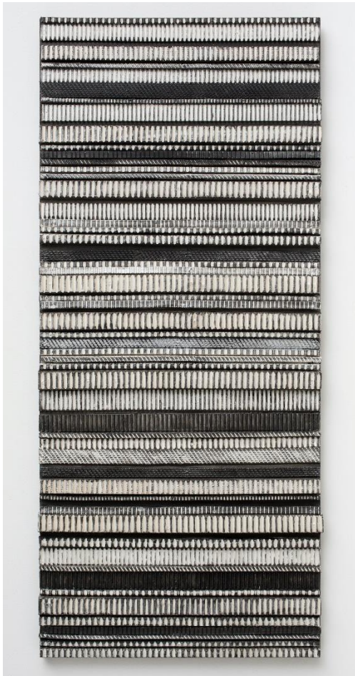
Brenda Mallory Cherokee Nation, b. 1955 ᎠᎩᎩᎩ ᎠᎩᎩᎩ ᎠᎩᎩᎩ ᎠᎩᎩᎩ #2, 2016 Drivebelt Experiment #2, 2016 Rubber drivebelts, paint on wood panel